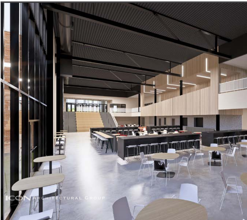
Concept interior rendering of student commons