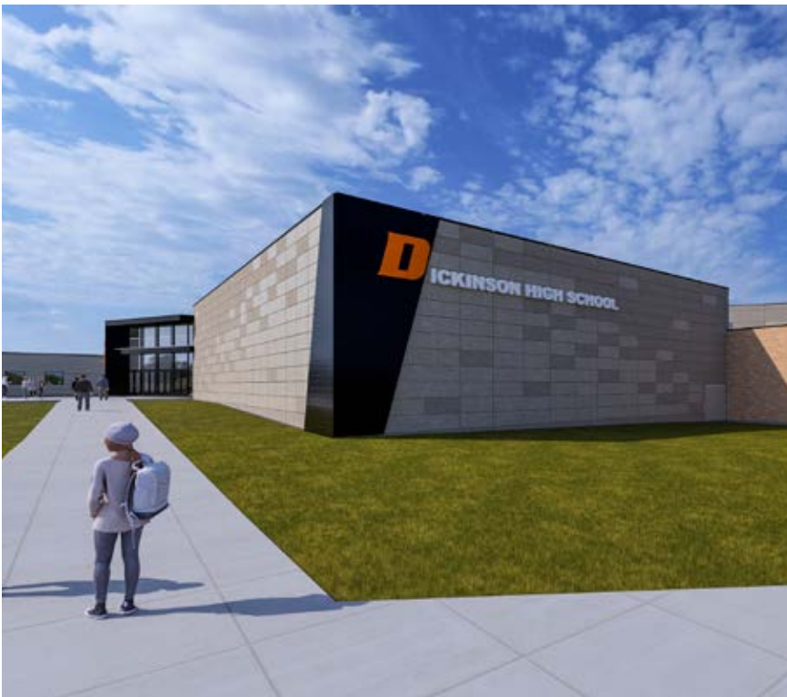
Exterior rendering of Main Entry / Theater