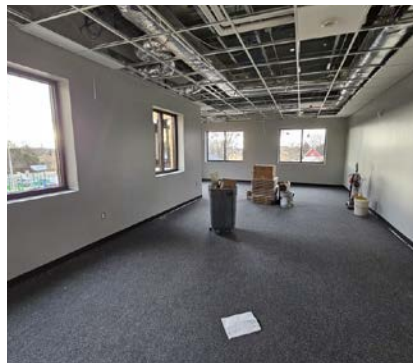
2nd Floor Interior