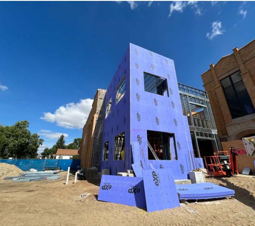
Roosevelt Elementary Addition - Construction Progress Photo